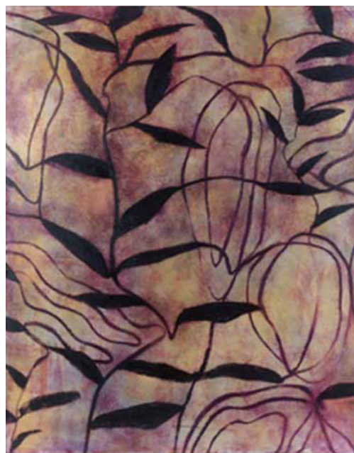
To Tell The Crooked Rose , 1995 Oil on canvas, 96 x 78 inches Times Warner Collection