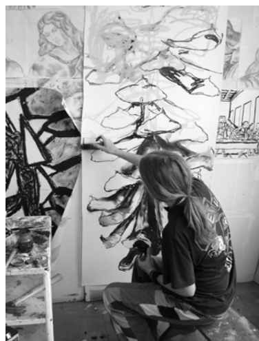
Body Echo™ Workshop , 2001 Hendrix College, Arkansas