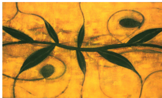
Genesis , 1996, Oil on paper, 34½ x 60 inches (Private Collection)