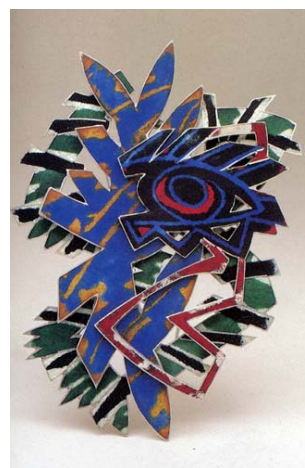
At The Snare III , 1984 Brooch – Silver, enamel, gold wires & silver foil, 9ct. pin, 7.5 cm x 5.5 cm. First exhibited: Victoria & Albert Museum, London, 1984.