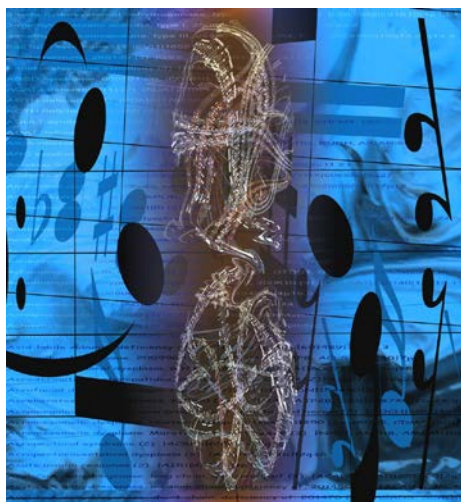
Birth of the Blues , 2006

Front-lit digital print on Kodak Endura 60 x 60 inches, Boston University, Main Lobby Life Science and Engineering building