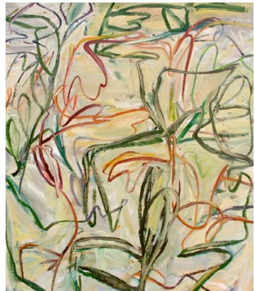
In The Beginning , 2008 Oil on canvas, 72 x 60 inches