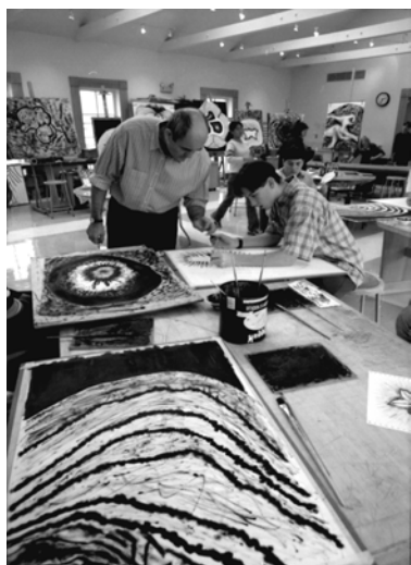
Growing Things™ Workshop , 1999 Suffield Academy, Connecticut