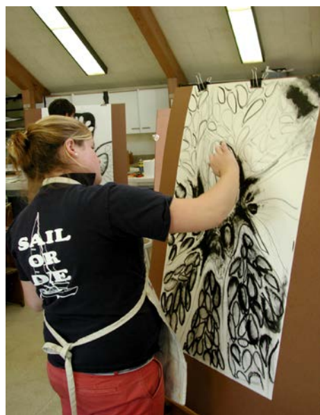
Growing Things™ Workshop , 2005 Tabor Academy, Massachusetts