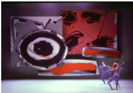
Red Steps , 1987

Set and costume designs for the London Contemporary Dance Theater. Choreography by Siobhan Davies. London Premiere at Sadlers Wells