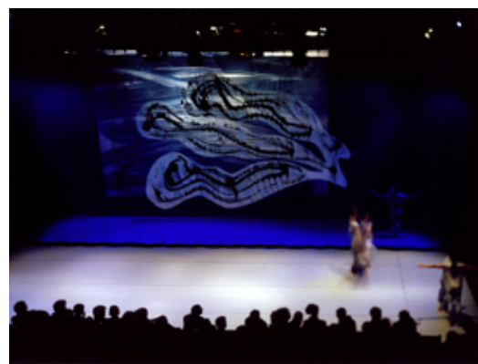
Drawn Breath , 1989

Set and costume designs for the Siobhan Davies Dance Company. Choreography by Siobhan Davies. London Premiere at Riverside Studio's, England