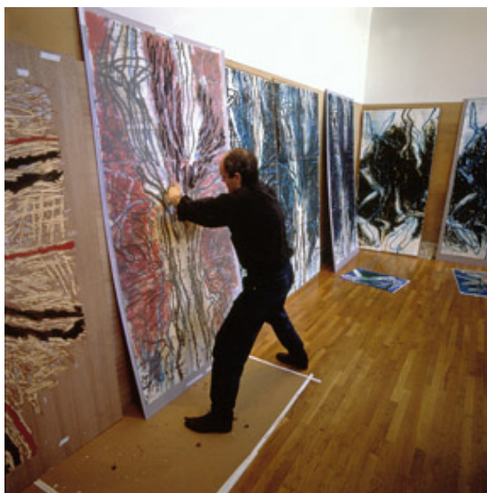
Melusine II , 1992