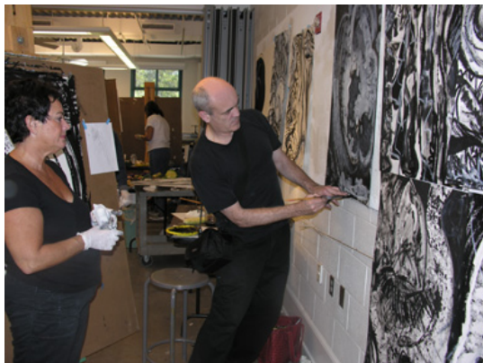
Growing Things™ Workshop , 2005 The von Liebig Arts Center, Naples, Florida, (Photo: Tina Eden)